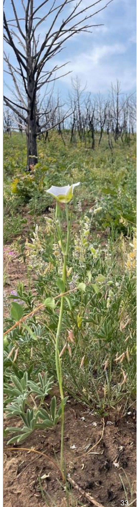
Segoly lily emerges in the Pine Gulch Fire burn scar.